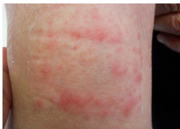
Fig.2: View of the high dermatological reaction to the monomer.

The following results were recorded at 48 hours. The intensity of the reaction is scored and recorded according to the rules of the International Contact Dermatitis Research Group (ICDRG). So, With the liquid monomer: the patient developed an intense allergic reaction that included vesicles, eruptions, and wide zones of erythema (Fig. 2).