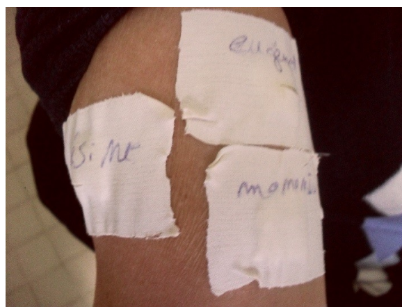
Fig.1: Patch test.

The patient was referred to a dermatologist for consultation, and to prove the diagnosis of hypersensitivity; patch test was done using the routine method described by Maxey. The test was carried out by cleaning the ventral surface of the forearm and placing spots approximately 10 mm square of several test materials on it: (a) liquid monomer; (b) auto polymerized resin made immediately before application; and (c) eugenol. The patches were placed in position with small gauze pads and hypoallergenic adhesive tape. The patients were instructed not to bathe the area and to leave the patch on for 48 hours (Fig. 1).