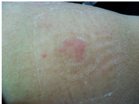
Fig.3: View of the weak dermatological response to polymerized resin.

With polymerized resin: the patient developed a weak reaction which showed moderate erythema with scarce papules which are considered a less severe reaction compared to the only monomer (Fig. 3).