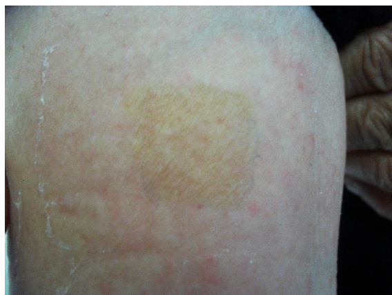
Fig.4: Negative dermatological reaction to eugenol.

With eugenol: the patient showed no allergic reactions and the response was negative (Fig. 4).