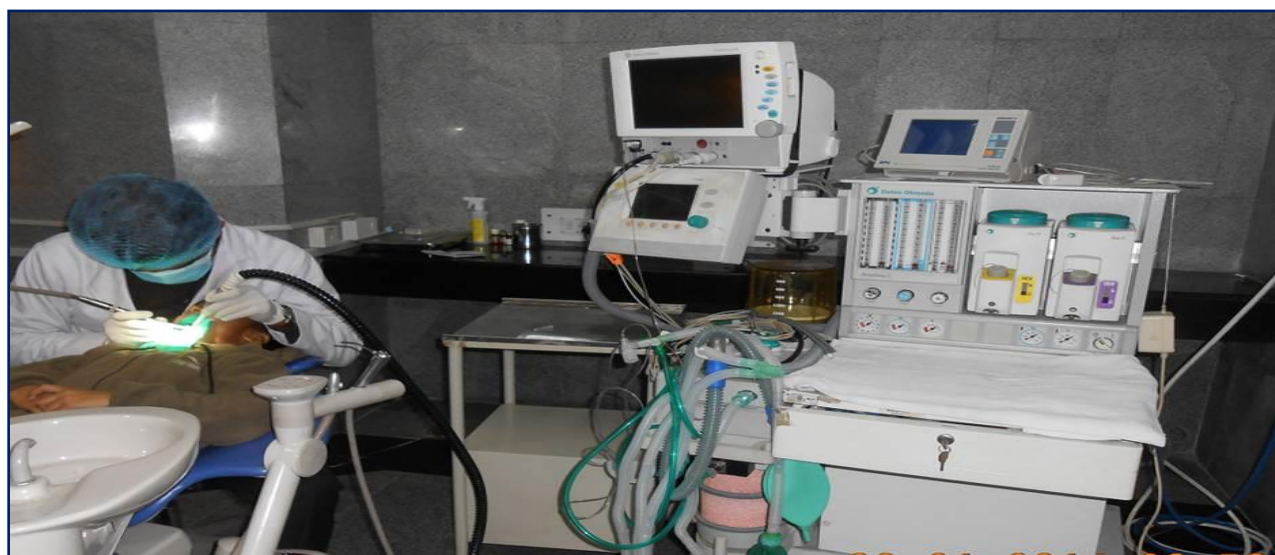
Fig:2. Conscious Sedation room in Oral Health Sciences Centre, Post Graduate Institution of Medical Education & Research (PGIMER, Chandigarh), a premier post graduate dental institution of India.

permanent registration with the State Dental Council. Candidates not possessing a recognized dental qualification for the above course are subjected to obtain a prior approval of his qualifications by the DCI before getting admitted to the MDS course in an Indian University. Admission to the course is through the academic merit screening test at the Central Government level. 8