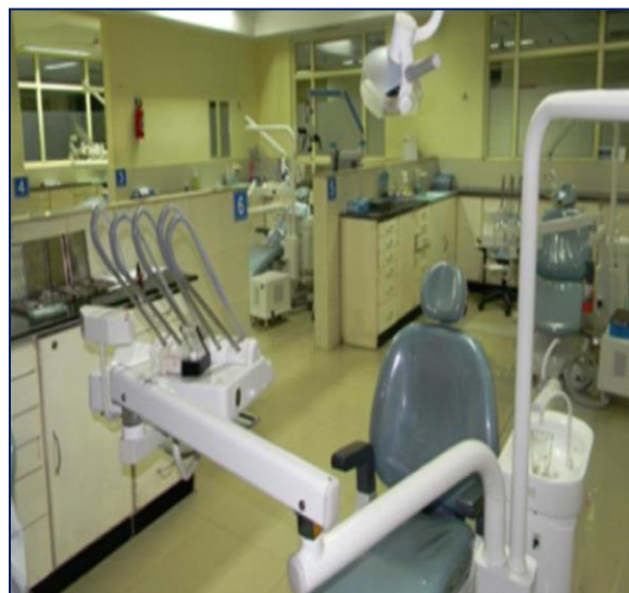
Fig: 3. A typical set up of an Indian educational institute imparting dental training.

After pursuing any of the Diploma courses, a candidate is open to a variety of options in his/ her dental career such as teaching in dental colleges, clinical research, and job in biomedical industries and can also approach speciality dental private practice.